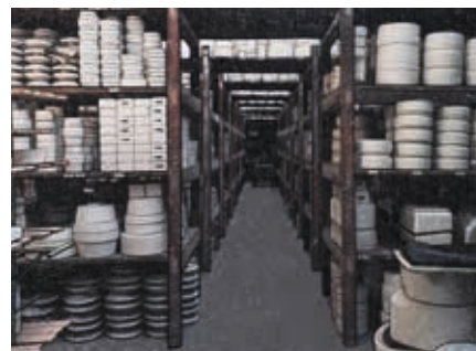
After a tour of the manufactory at the 18th-century Schloss Nymphenburg, we ate white sausage and pretzels off 'Cumberland' plates in the CEO's office.